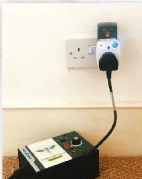
RCD & Surge Protector set up