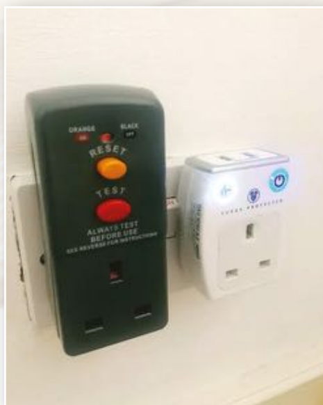
RCD & Surge Protector set up

www.heraplateuk.com/product-page/rcd-surge-protector